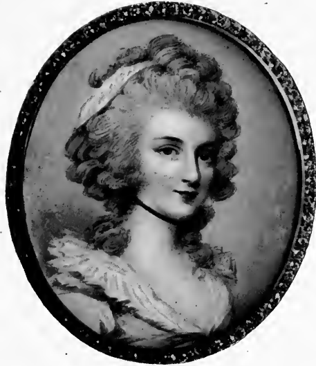
MISS MARY BERRY BY GEORGE ENGLEHEART